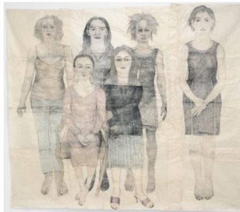
New York artist Kiki Smith is represented by this delicate unframed drawing.

One cannot question the star power of Fischl's selections. Anyone who cares about contemporary art will be familiar with most of the names on his roster. The works of many, such as Robert Rauschenberg, Cindy